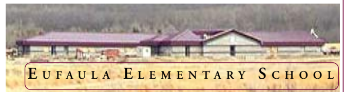
EUFULA ELEMENTARY SCHOOL